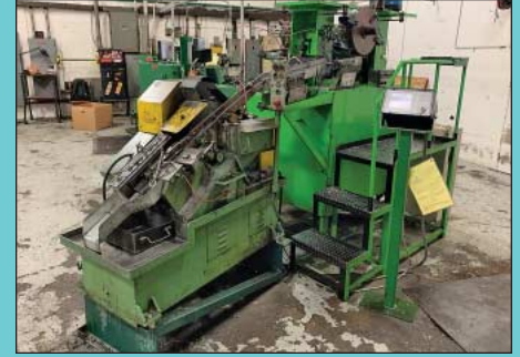
Union Model USR-3R Incline Thread Roller w/ Ming Tang MT-1208 SEMS

Warren Slotter Model WS-1000 with Vibratory Bowl