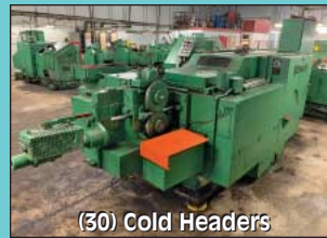
(30) Cold Headers