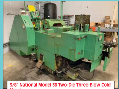
3/8" National Model 56 Two-Die Three-Blow Cold Header