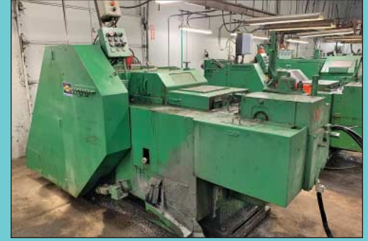
1/2" National Model 68 DSSD High Speed Cold Header