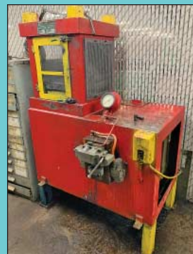
200 Ton Modern Hydraulic Hobbing Press