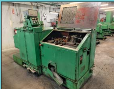
(3) 3/16" National Model 34 High-Speed Long Stroke DSSD Cold Headers