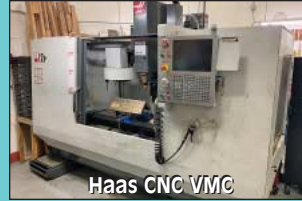
Haas CNC VMC