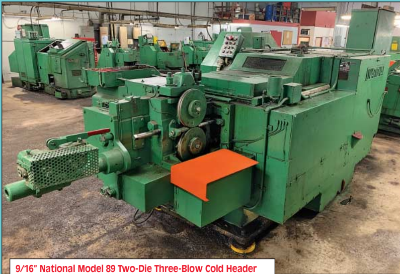
9/16" National Model 89 Two-Die Three-Blow Cold Header

SALE DATE: WEDNESDAY, APRIL 10TH, STARTING AT 10:00 AM INSPECTION: DAY PRIOR FROM 10:00 AM TO 4:00 PM