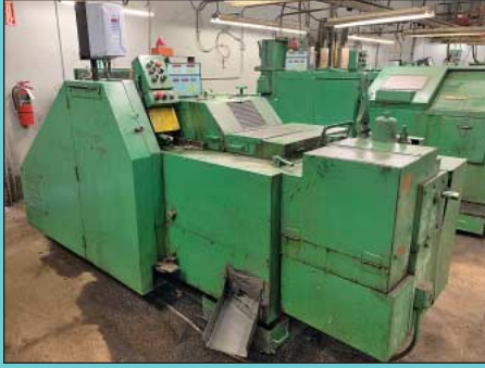
3/8" National Model 56 High-Speed Medium Stroke DSSD Cold Header