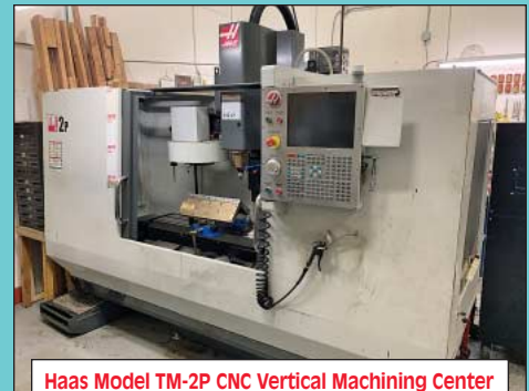
Haas Model TM-2P CNC Vertical Machining Center