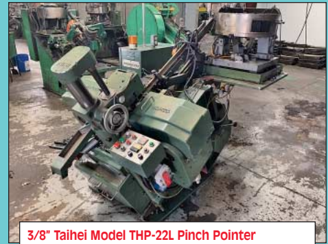
3/8" Taihei Model THP-22L Pinch Pointer