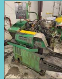
(2) Warren Model WT-1000 Thread Rollers

ICP Model IRDP800-4 Air Dryer; s/n 150002460 (New 2015)