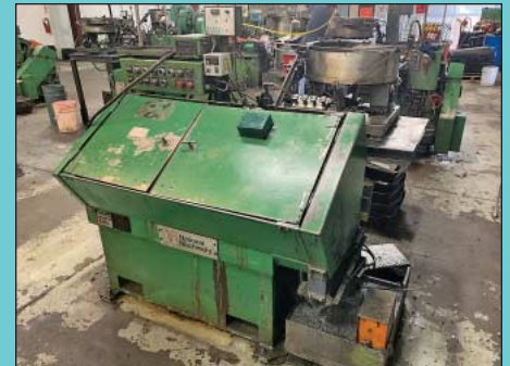
National Model 0-800 Thread Roller w/ Vibratory Bowl