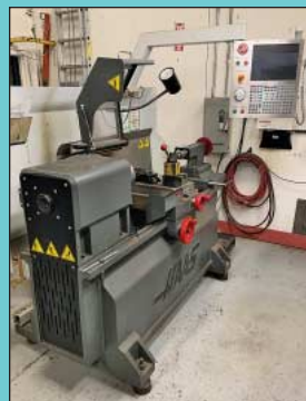
16" x 30" Haas Model TL1 Flat Bed CNC Lathe