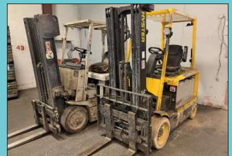
(5) Forklifts by Hyster, Yale & Others