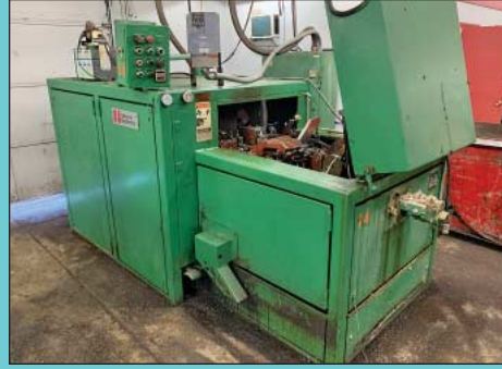
1/4" National Model 62 Two-Die Cold Header