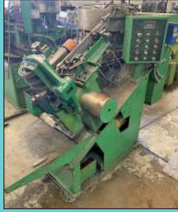
Betz Shank Slotter w/ Vibratory Bowl and Assembly Station