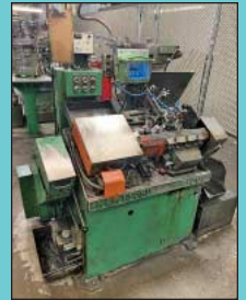
(7) Hartfield 10-400, 0-400 & 0-500 Thread Rollers