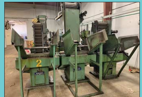
(10) Warren Model WL-1000 Parts Loaders from 6" to 18"