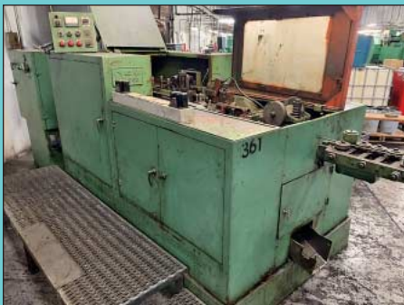
5/16" Nakashimada Model PF-860 Two-Die Three-Blow Cold Header