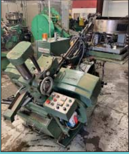
3/8" Taihei Model THP-22L Pinch Pointer