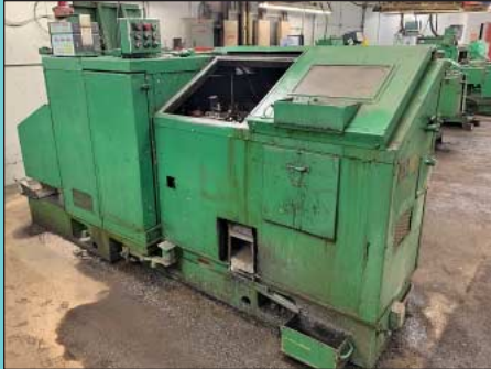
5/16" National Model 45 High-Speed Medium Stroke DSSD Cold Header