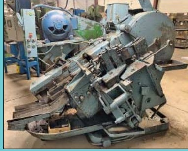
Waterbury Farrel Model #40 Pick and Place Chain Feed Thread Roller