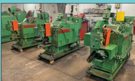
(12) 3/16" National Model 3/16 and 3/16-HS DSSD Cold Headers