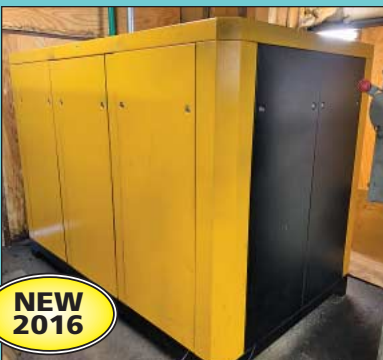
200 HP Eaton Polar Model PRV2000003 Air Compressor